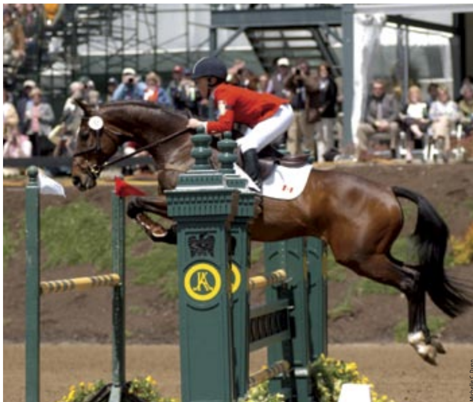
Show Jumping Comparison with Livingstone (above) and Winsome Adante (below). Notice that as the scapula is rotated, the point of shoulder rises and the front legs can fold out of the way. Also notice how the stifle has moved to aid in clearance of the hindquarters. Imagine how much more difficult this would be if the LS was not well placed.

Please visit her website at www.jwequine.com .