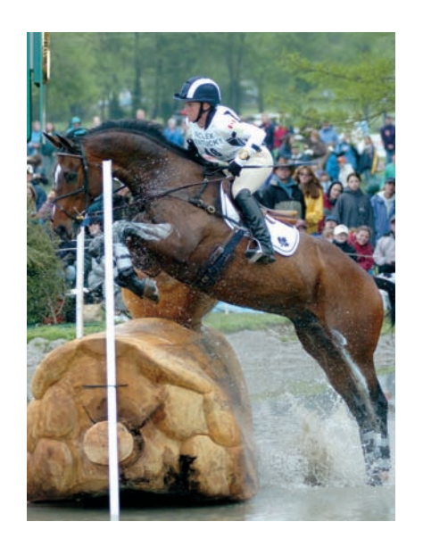
Livingstone (left) and Winsome Adante (right) – Notice the folding of the forelegs and the scope that comes from the ability to move the stifle through a full range of motion. Also notice the use of the neck for lifting.