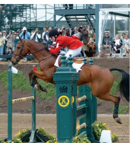
Show jumping comparison with Livingstone (left) and Winsome Adante (right): Notice that as the scapula is rotated, the point of shoulder rises and the front legs can fold out of the way. Also notice how the stifle has moved to aid in clearance of the hindquarters. Imagine how much more difficult this would be if the LS was not well placed.

is set so close to the body that it strikes the horse's ribcage will cause the horse to shorten the stance phase on the contact side and, as a result, shorten the swing phase on the opposite side. In