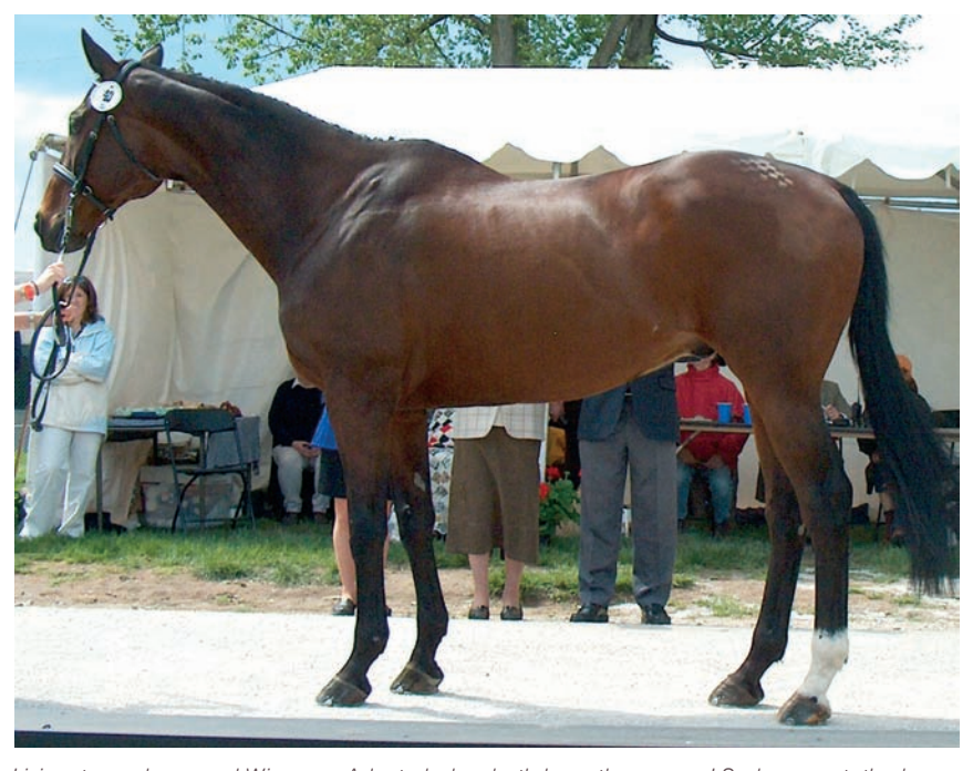
Livingstone above and Winsome Adante below both have the proper LS placement, the low stifle placement, the length of humerus, the high point of shoulder and the lightness in front of the pillar of support. Also note Winsome Adante's straighter hind leg, which aids in collection.